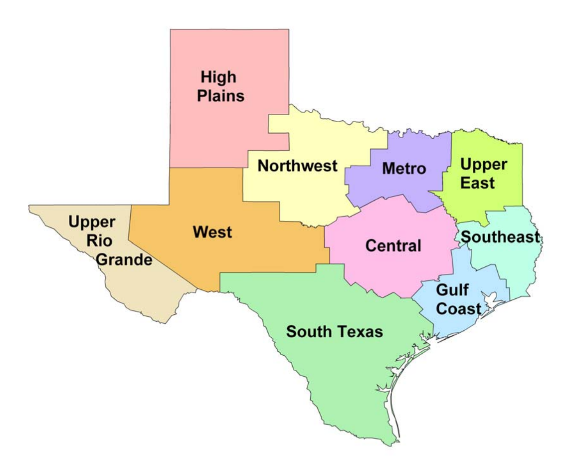
Figure 2 Texas Higher Education Coordinating Board Ten Regions